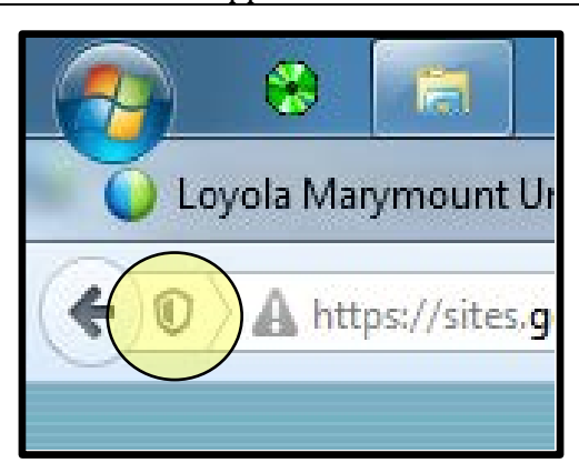
STEP 1: Locate the shield in the URL bar in the upper left-hand side of the window and click on the symbol.

When you click on the shield, the following notification appears.